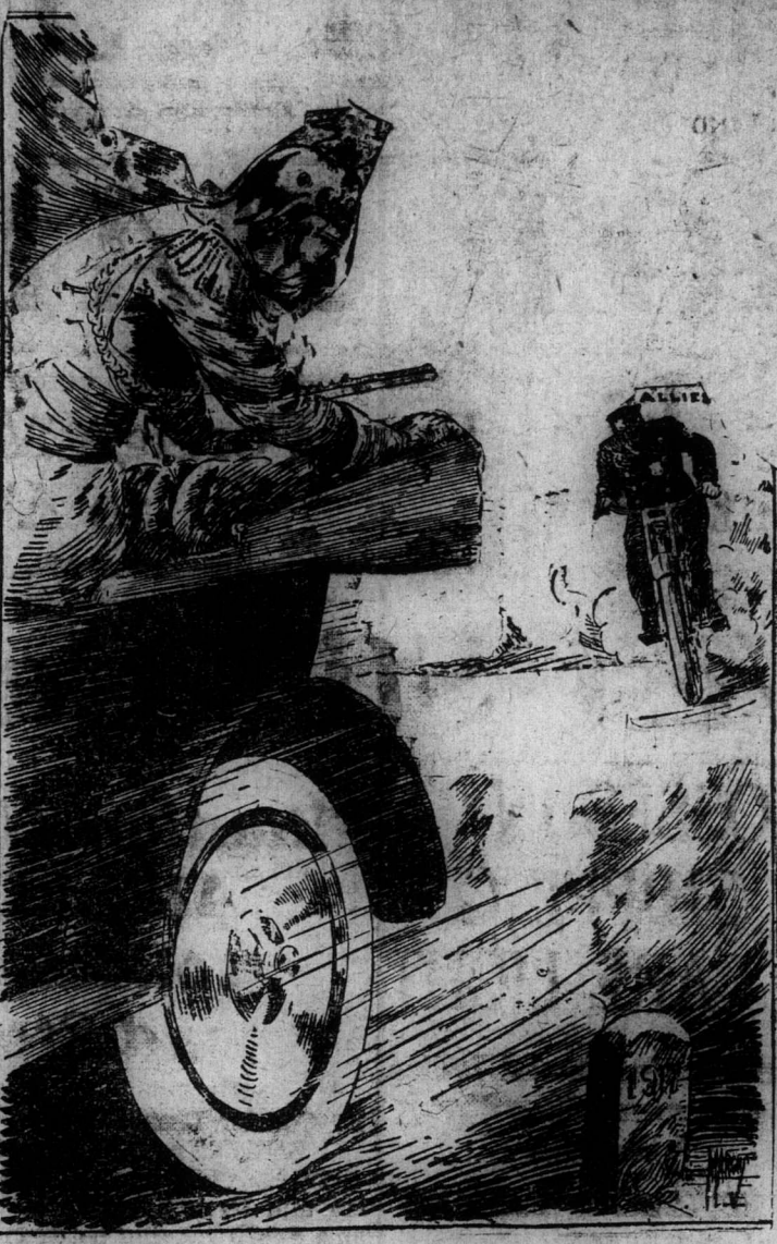
KAISER: "He's gaining fast—and I had a forty years' start!"

Heavy excursion parties from the north continue to pass through to the Port daily. Yesterday's were exceptionally large.