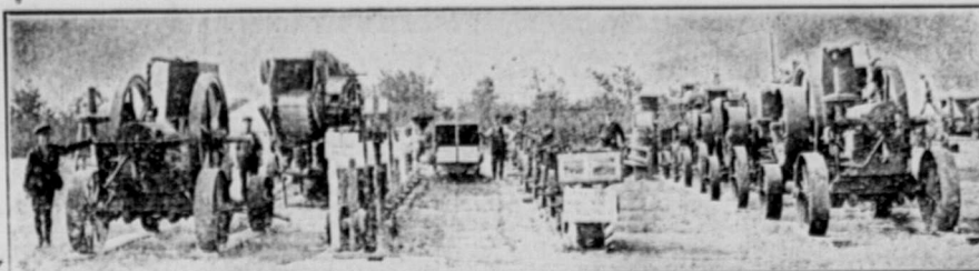
View of Our Exhibit at Brandon Exhibition, 1910

ALL THE LATEST GAS ENGINES FOR SAVING LABOR