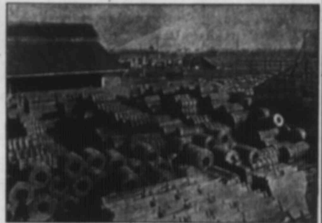
Part of our Fencing Stock ready for shipment from Winnipeg warehouse

What else is there that you will need soon? Our stocks are in good shape and we are in a position to take care of your orders promptly. Ask us for catalogs or any information that you may need.