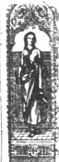
FIGURE and Ornamental MEMORIAL WINDOWS AND GENERAL Church Glass. Art Stained Glass For Dwellings and Public Buildings

Our Designs are specially prepared and executed only in the very best manner.