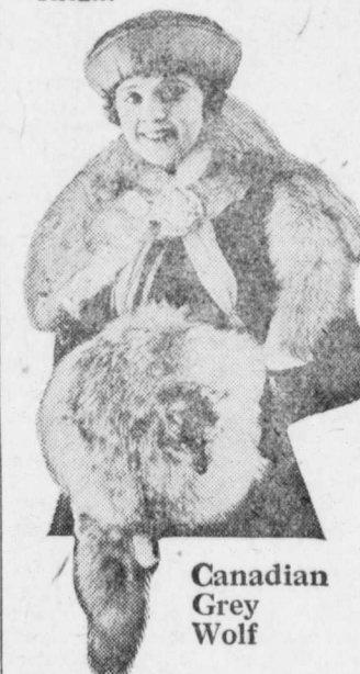
Canadian Grey Wolf

No matter where you live you can obtain the latest styles and the highest quality in furs from Hallam's by mail—at the same prices as if you lived 10 miles from Toronto.