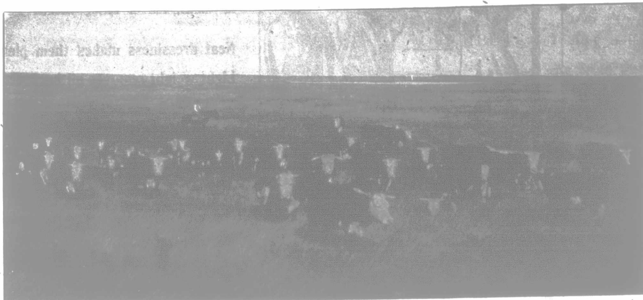
Hereford Cattle, Crane Lake, Assiniboia, Main Line Canadian Pacific Railway.

The Canadian Pacific Railway Company have 12,000,000 acres of choice farming lands for sale in Western Canada. Manitoba and Eastern Assiniboia lands generally from $4 to $10 per acre, according to quality and location. South-western Assiniboia and Southern Alberta lands, $3.50 to $8 per acre. Ranching lands generally $3.50 to $4 per acre. Northern Alberta and Saskatchewan lands generally $6 to $8 per acre.