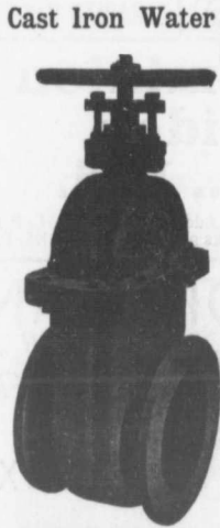
Flanged End Gate Valve with Hand-Wheel.