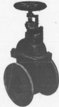
Indicator Gate Valve.

Cast Iron Water and Gas Pipe Special Castings of all kinds Valves Hydrants Valve Boxes