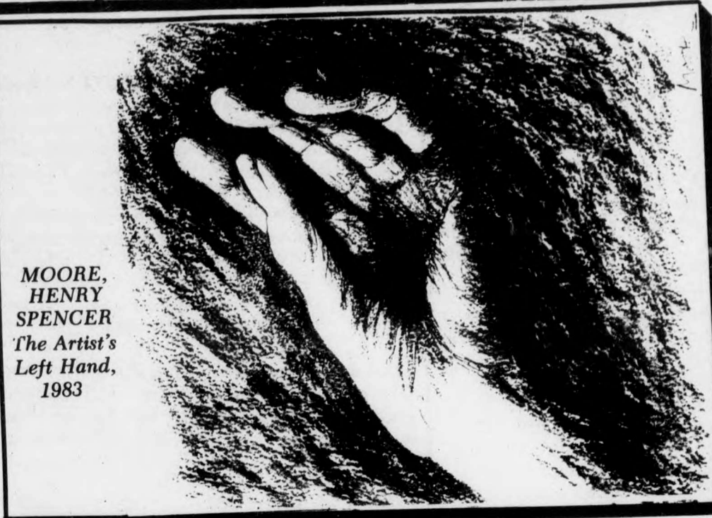
MOORE, HENRY SPENCER The Artist's Left Hand , 1983