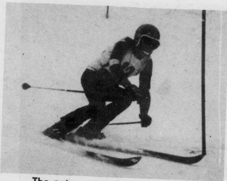
The autor going through a gate