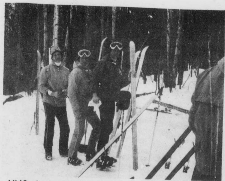
UNB skiers preparing for victory in Edmunston