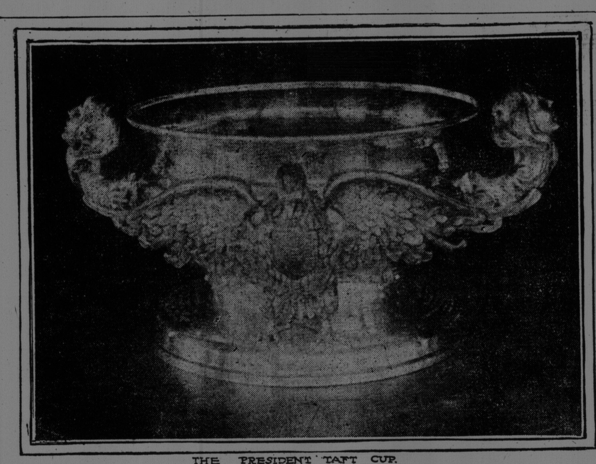
THE PRESIDENT TAFT CUP