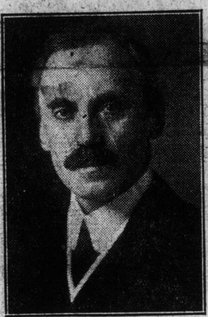
HON. N. W. ROWELL.