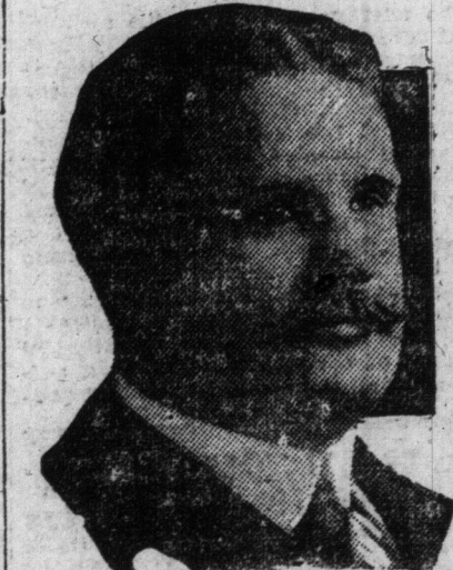
ALAN R. HAWLEY missing aeronauts

MONTREAL, Oct. 25 .- It is whispered here that the Ottawa government has about agreed to guarantee bonds to the extent of a hundred million dol-lars for the construction of the Georgian Bay ship canal.