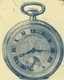
LOUIS XIV Gruen Verithin Model - - $55 to $190