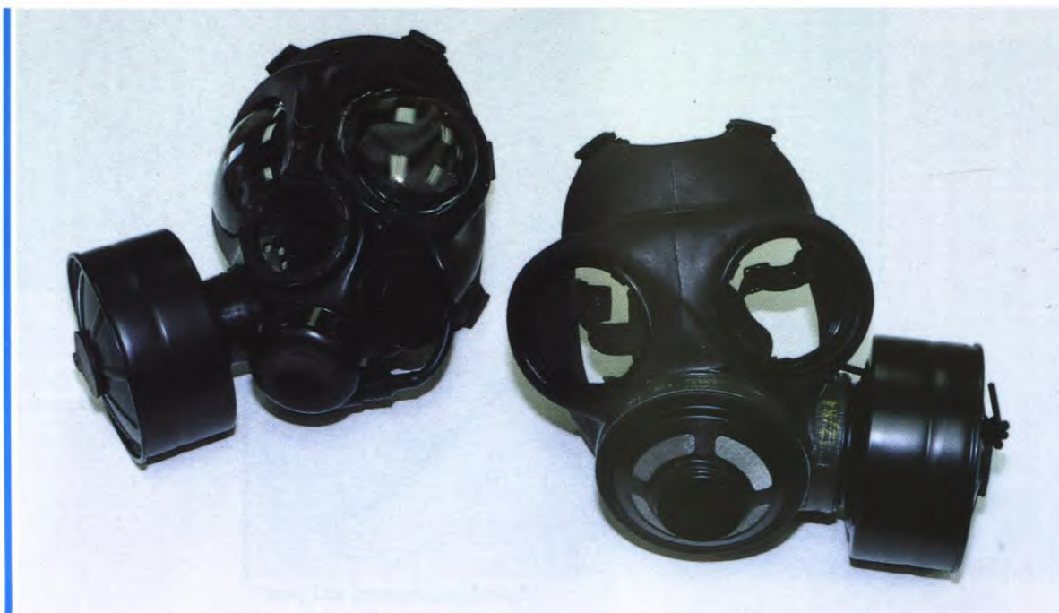
Facemask with C2 canister.