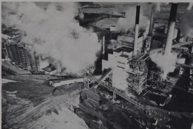
Several lumber companies in British Columbia burn hog fuel to power their mills. Bark, sawdust and waste wood are hogged (chopped up), and moisture is pressed out. Left, the prepared hog fuel comes out of the press at the MacMillan Bloedel mills at Port Alberni. Right, hog fuel is piled outside the British Columbia Forest Products mill at Crofton on Vancouver Island.

generator at the company's pulp and lumber complex in Mackenzie, British Columbia, will produce 20 megawatts of electricity.