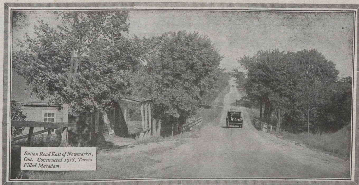
Sutton Road East of Newmarket, Ont. Constructed 1918, Tarvia Filled Macadam.