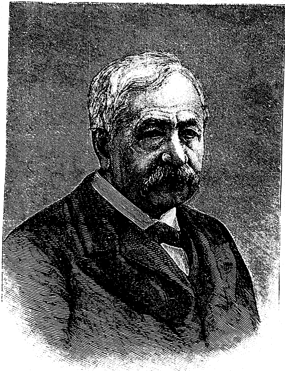
THE COUNT FERDINAND DE LESSEPS, CHIEF PROMOTER OF THE PANAMA SHIP CANAL.