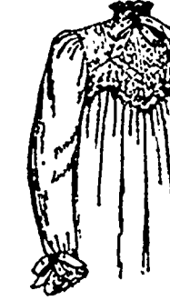
7876-LADIES' NIGHT GOWN. 32, 34, 36, 38, 40 and 42-inch bust. French cambie, with insertion and valenciennes lace. Ready-made tucking with insertion, or plain tucking outlined with fancy heading, through which narrow wash ribbon is run, may be used.