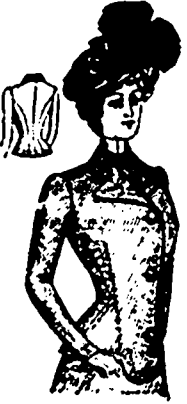
8091 - LADIES' FIGHT-FITTING DOUBLE-BREADED JACKET. 22, 24, 26, 28 and 30-inch bust. Broad or ladies' cloth, pellicle chevrot, covert or melton is appropriate for this mode. The revers and collar may be faced with velvet and large velvet or fancy buttons used on the front, if a more dressy effect is desired.