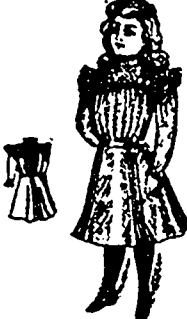
8026 - CHILD'S DRESS. 4, 6, 8 and 10 years. Cashmere, venetian, covert, poplin or chevrot are appropriate for this mode, with ribbon, silk, velvet, lace or braid for trimming.