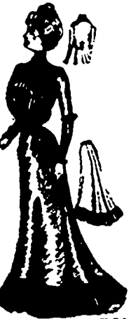
8099 - LADIES' WAIST WITH GRADUATED YOKE. 8091-LADIES' THREE-PIECE SKIRT. Waist, 32, 34, 36, 38 and 40-inch bust. Skirt, 22, 24, 26, 28, 30 and 32-inch waist. Poplinette, crepe de chine, lansdowne, broad and ladies' cloth are appropriate fabrics for this mode, with lace, velvet, silk or stamped-out cloth for trimming. The skirt is finished with new century brush binding which is silky and does not rub the shoes.