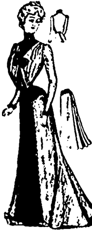
8089-LADIES' FAN CRY WAIST. 8091-LADIES' THREE-PIECE SKIRT. Waist, 32, 34, 36, 38 and 40-inch bust. Skirt, 22, 24, 26, 28, 30 and 32-inch waist. The costume may be developed in henrietta, chevrot, poplin, venetian or lansdowne. The skirt may be made entirely of cloth and passementerie or braid applied along the perforated lines if a plainer effect is desired.