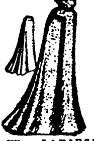
8091 - LADIES' THREE-PIECE SKIRT PERFORATED FOR PANEL AND YOKE. 22, 24, 26, 28, 30 and 32-inch waist. Broad and ladies' cloth, venetian, henrietta, chevrot, covert or lansdowne are appropriate fabrics for this mode. They may be combined with another fabric the same color as the skirt, but a different shade.