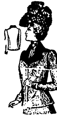
8087-LADIES' SINGLE-BREADED JACKET WITH JOCKEY FRONT. 32, 34, 36, 38, 40 and 42-inch bust. Diagonal broad and ladies' cloth, venetian, melton and covert are appropriate fabrics for this mode. The collar and revers may be of cloth if preferred.