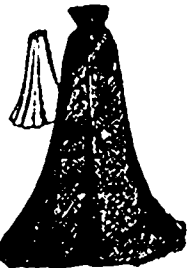
7903-LADIES' FIVE-COURED SKIRT. 22, 24, 26, 28 and 30-inch waist. The skirt is given in fashionable length with slight train perforated for walking length. It can be made up in silk or woolen materials such as venetian or broadcloth, chevrot, serge, crepon and ladies' cloth.