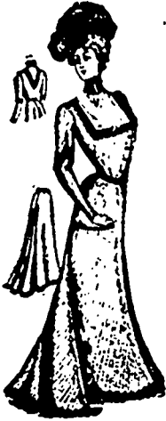
8083-LADIES' TAILOR-MADE WAIST. 7843-LADIES' SKIRT WITH UNDERLYING PLAITS. Waist, 32, 34, 36, 38 and 40-inch bust. Skirt, 22, 24, 26, 28, 30 and 32-inch waist. This dress may be fashioned in camel's hair, angora, diagonal suiting, ladies' cloth, chevrot or poplin, with lace, velvet, ribbon, silk or applique for trimming. The yoke back and front, also upper sleeves, may be made entirely of velvet or silk if preferred.

Patterns should be ordered of the Office of this Publication. Full directions, quantity of material required and illustration of garment with each pattern.