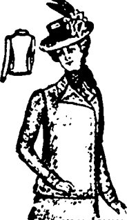
8090 - MISSES' DOUBLE-BREADED JACKET. 12, 14 and 16 years. Venetian, broad or ladies' cloth, melton, chevrot and diagonal are appropriate fabrics for this mode. The jacket may be made in suite with a stylish skirt, or used as a separate outside garment if preferred.