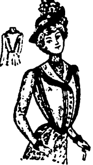
8102 - LADIES' WAIST. 32, 34, 36, 38 and 40-inch bust. Smart waists in this mode may be developed in taffeta, cloth, covert, venetian, crepline, poplin or henrietta, combined with silk, velvet, panne, applique and fancy braids.