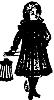
8091 - CHILD'S DRESS. 4 and 6 years. Attractive little frocks in this mode may be developed in silk, crepe de chine, poplin, henrietta or veurlian with velvet, lace, applique, silk or fancy braids for decoration.

For the information of those interested a little book will be mailed free by addressing F. A. Stuart Co., Marshall, Mich., giving briefly the symptoms of the various forms of stomach weakness, causes and cure.