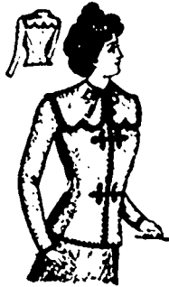
8100 - LADIES' DRESSING SAKQUE. 32, 34, 36, 38, 40, 42, 44-inch bust. Cashmere, French flannel or nankeenette is appropriate for this mode. The edges may be finished with wash ribbon or contrasting color and the jacket tied with three bows of ribbon down the front, omitting the frogs.