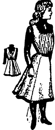
8028-GIRL'S COSTUME. 6, 8, 10 and 12 years. Attractive dresses in this mode may be developed in henrietta, nun's veiling, covert, serge or any of the new novelty goods, combined with silk, lace, ribbon, braid and velvet.