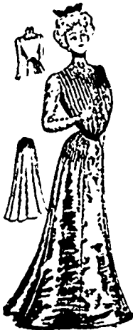
8097 - LADIES' PLAIDED WAIST WITH FLYING SKIRT. 8071-LADIES' THREE-PIECE TUCKED SKIRT. Waist, 32, 34, 36, 38 and 40-inch bust. Skirt, 22, 24, 26, 28 and 30-inch waist. Taffeta, voile, lansdowne, crepe de chine or poplin is appropriate for this mode with silk, velvet, lace, panne, Persian trimming or stamped applique for decoration.