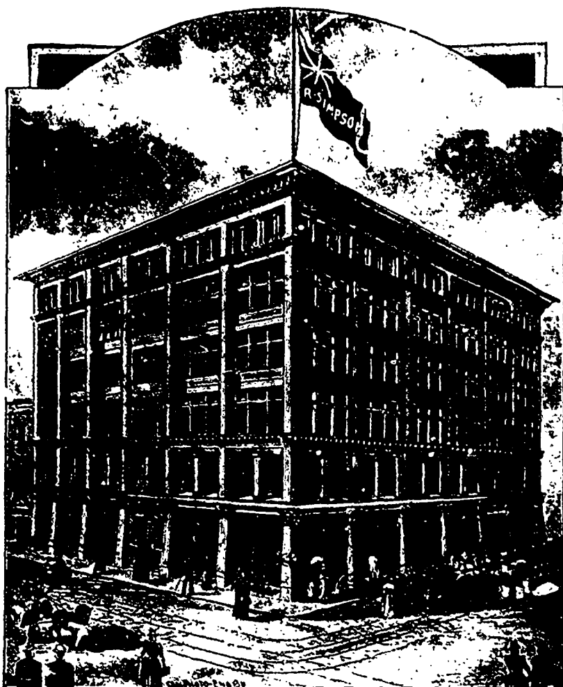
CANADA'S LEADING RETAIL HEADQUARTERS.