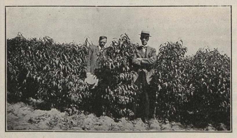
PHOTOGRAPHED IN AUGUST-BLOCK ONE- YEAR PEACH TREES