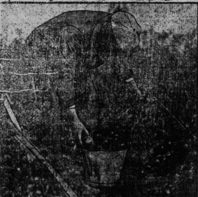
Gathering Tomatoes in Alberta.