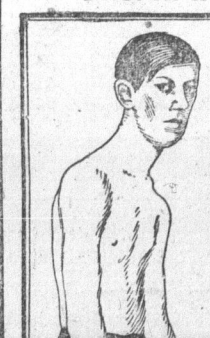
A NERVOUS WRECK