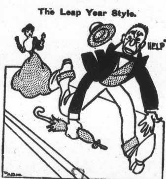
The Leap Year Style.

Strayed into the sanctum of the Athens Reporter Office, a Fox Terrier. He has good breeding marks, a pleasing countenance, a friendly disposition, a variable appetite, a broken leg, and a strong antipathy for cats. Owner will please call at the Reporter Office.