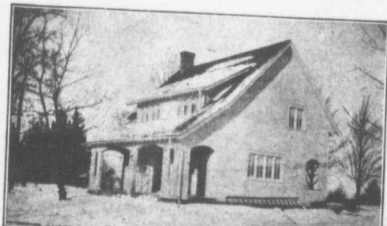
Farm Foreman's Home on Roycroft Stock Farm.

Where you are entertaining both young ladies and gentlemen at a dinner shower, have some singing and instrumental music. Try this contest, the answer in each case to be a kitchen utensil: (1) What a good workman has and to rent? (Skillet).