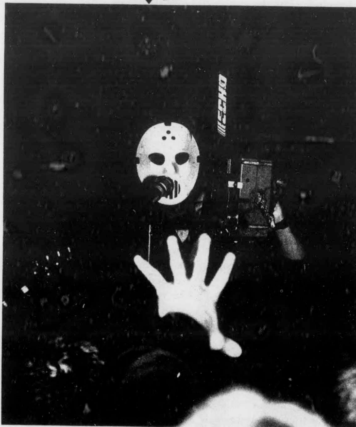
The Friday the 17th Pyramid Warehouse Massacre.

After the show I had the opportunity to speak with the members of D.O.A. I felt odd at first,