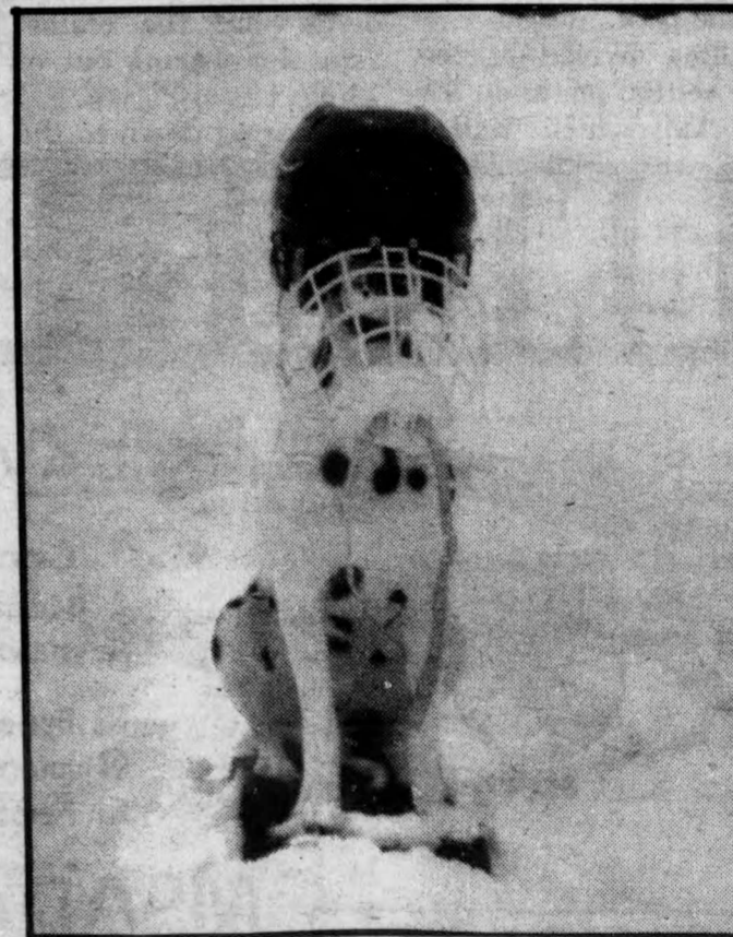
"Coach, Can I play for Rosary?" barks Spot.

As things died down at The Arms, Rosary lit up and an invitation was sent out to the Fredericton Fire Department to cap off a very successful weekend!