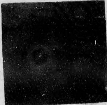
Stephen Burrige Bus. Admin. 1

No. If they want to be involved in extra-curricular activities, it's just an extra activity, like people playing for a UNB sports team.