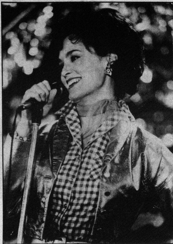
Top left: Patsy Cline; center: Jessica Lange; lower left: K.D. Lang

Lang joins a long list of country stars profoundly influenced by Cline. It's Cline's face that graces the barn window on Lang's album, and it's those Cline cover songs delivered with such love and power that have become Lang's tour de force.