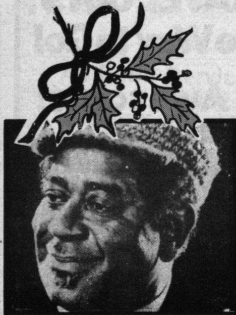
Living legend DIZZY GILLESPIE Saturday, January 15 at 7:30 and 9:30 PM

So you think they have everything? They don't! Buy the ideal Christmas gift. Tickets to SUB THEATRE's upcoming presentations —