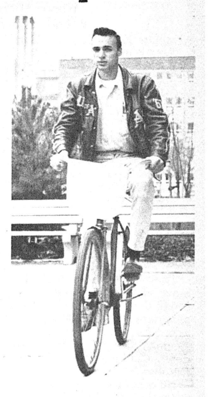
MOST WALK ...