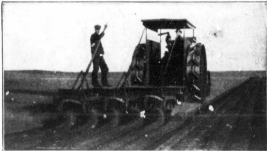
Four, Six, Eight, Ten, Twelve or Fourteen Bottoms Plows assembled in pairs—One lever for each pair—Frame mounted on wheels

The outfit here illustrated is doing more than four men could do with teams and single bottom plows.