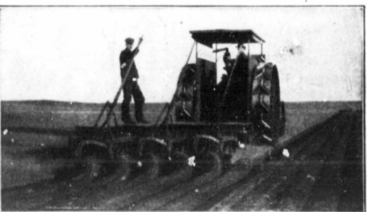
Four, Six, Eight, Ten, Twelve or Fourteen Bottoms

Mr. Thresherman, you can double the earning power of your engine by getting one of our engine gangs