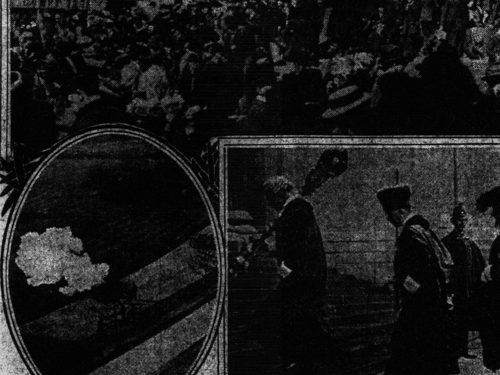
ARRIVAL OF DEPUTY MAYOR AND CITY OFFICIALS AT ST. PAUL'S, MAY 7th.