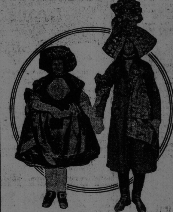
SCHWALM VALLEY BRIDE AND BRIDEGROOM

There has been much talk in this country of the styles women have chosen for their dresses and of the manner and sizes of the hats they have worn. These critics probably mentioned simple folk in their discussions and never dreamed that for outlandish attire some of the world's American streets as gowns hardly worth mentioning.