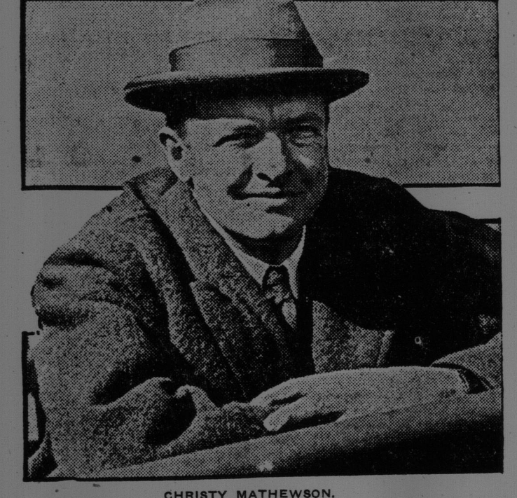
CHRISTY MATHEWSON. In his day the greatest pitcher in baseball, Christy Mathewson now lives in the calm life of the magnate. "Big Six" is financially interested in the Boston Braves. "I still get a kick out of the game," says the noble old warrior, "especially when my boys win." Mathewson is pictured here watching a game from his private box.