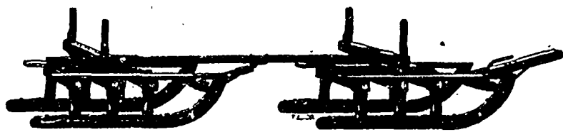
A 52—2 inch Runner Three-Kneed Sleigh, with Bolsters 38, 40 or 42 in. A 53—2½ inch Runner Three-Kneed Sleigh, with Bolsters 38, 40 or 42 in.