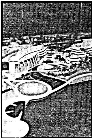
Museum of Man

The designs are impressive. The Museum of Man, says Alberta architect Douglas Cardinal, "will be vibrant — maybe a little bit like Disney World". It will consist of two buildings joined by a series of decorative pools designed to look as though they are connected to the river. Located in Laurier Park, Hull, it will face the Parliament Buildings. The National Gallery is to be a three-storey building of glass, copper and stone with a glass entrance and a 80-metre ramp leading up to a 36-metre high "grand hall" that will look out onto Parliament Hill as well. Montreal architect, Moshe Safdie, says that he wants it to have a "calm, continuous atmosphere ... like a living room for the city". The structure will be located at Sussex and St. Patrick Street.