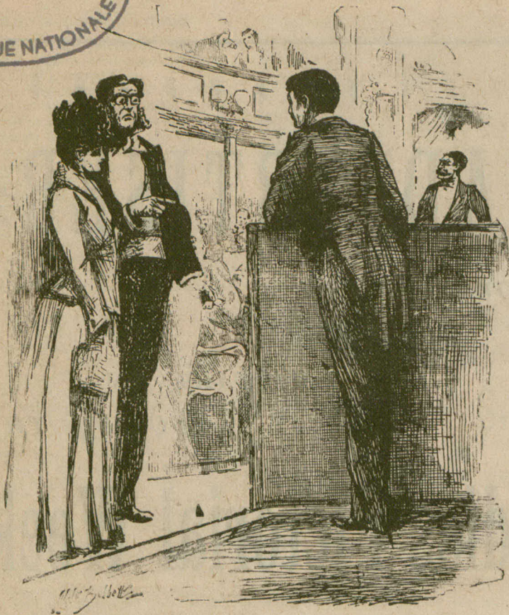
THOSE CONFUSING DRESS-SUITS.

MR. BEENTHAR—"P'raps you'll show us to our seats?" MR. CUMMERFORD—"Sir! I am a gentleman." MR. BEENTHAR—"Glad of it, my friend. The other one down the aisle there is a hog."