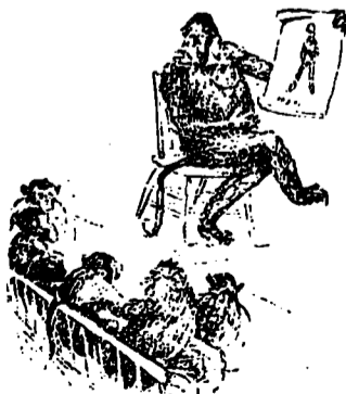
FIFTY THOUSAND YEARS HENCE.

The great Italian master, whose latest opera, "Otello," was produced at Milan on the evening of February 7th, and scored a brilliant success, is in his seventy-four year. His first serious work, the musical drama of "Oberto di San Bonifazio," was produced in 1839; and the series of well known operas which followed placed him in the front rank of the great Italian composers, of whom he is to-day the sole survivor. The libretto of "Otello" is based upon Shakspeare's drama. The music is in Verdi's grandest and most advanced style. That the work is a masterpiece, appears to be agreed on all sides. Signor Verdi will visit Paris this month to be present at the execution of his "Requiem" at St. Eustache on the 10th inst. This requiem was composed in memory of the famous Italian novelist and poet, Manzoni, and has never been rendered in any Paris church.