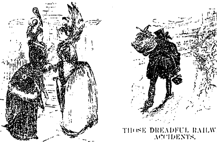
THEY MUST HAVE THEM.

SMITH.—Who is that gentleman you were talking with just now? BROWN.—He claims to be a titled Englishman of distinguished family, but I doubt it. SMITH.—Why? BROWN.—Because he did n't ask me to lend him any money.