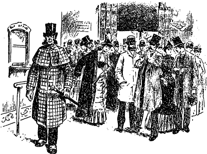
A DOUBTFUL CHARACTER.

The whole affair, which is inclosed in a box, constitutes an interesting toy that is equally well adapted for the amusement of the young or to small cabinets of physical apparatus for elementary instruction.