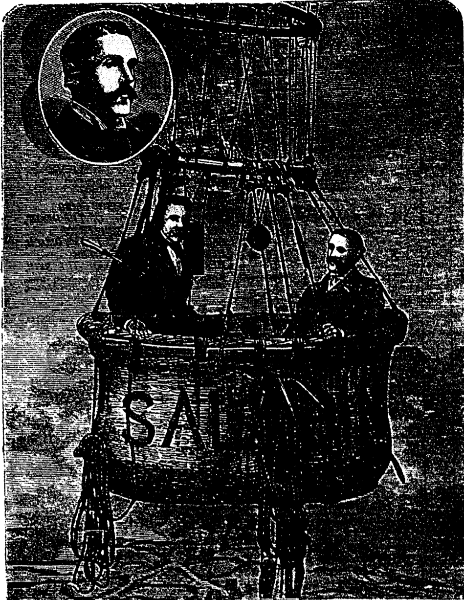
THE FATAL BALLOON DISASTER IN ENGLAND.

One copy, one year, including postage.....$2.00 One copy, six months, including postage... 1.10 Subscriptions to be paid in ADVANCE