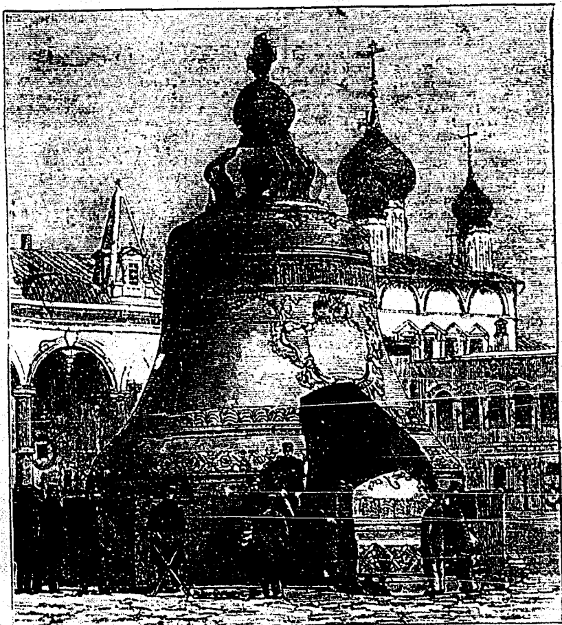
CZAR-KOLOKOL, THE BIG BELL OF MOSCOW.