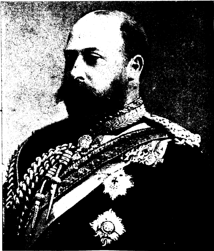
KING EDWARD VII.