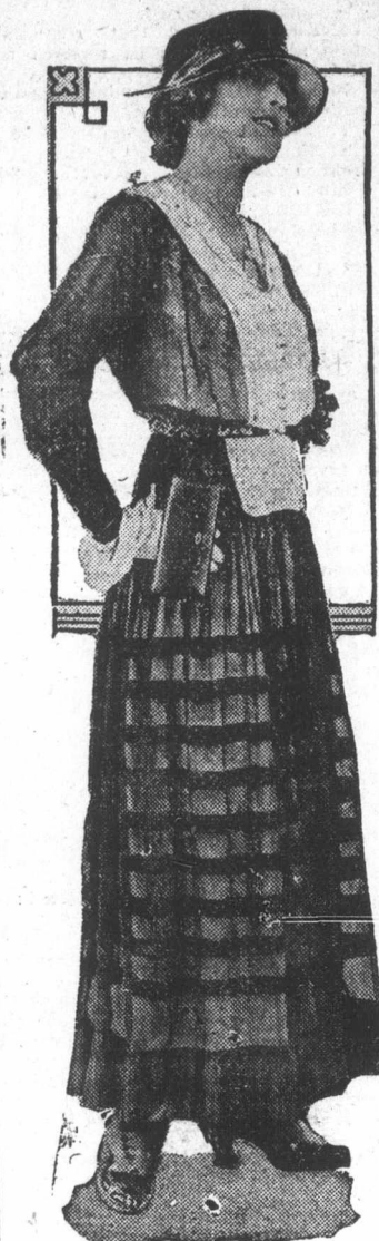
A CHARMING EFFECT.

This smart frock is of navy blue indestructible voile, featured in a full tuck skirt with a taffeta hem and finished in a shirred yoke effect. The