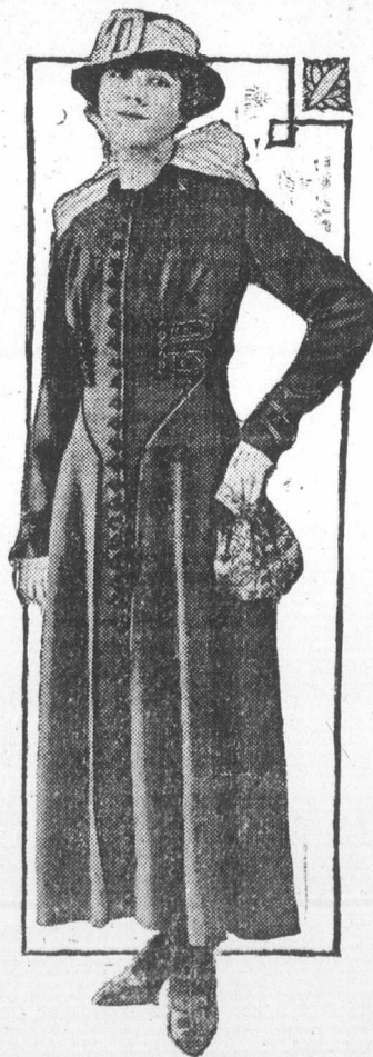
BUTTONS AND BRAID.

The one piece gown still holds its own for early fall wear, and this one is developed in autumn leaf brown with a turnover collar, trimmings of