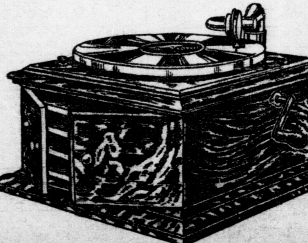
VICTROLA VI. $32.50