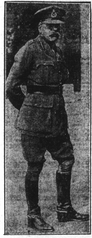
BRITAIN'S GENERAL Sir Douglas Haig, who has gained the greatest British victory of the war and has not yet suffered a single reverse since he assumed command.

FUNK & WAGNALLS COMPANY (Publishers of the Famous NEW Standard Dictionary), NEW YORK