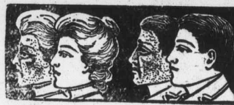
BEFORE AND AFTER TREATMENT.