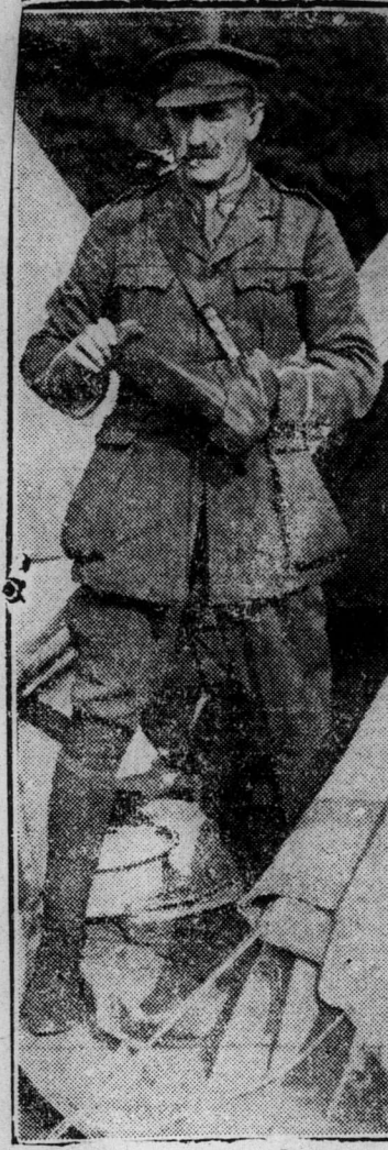
Prominent English barristers, actors and journalists are in camp at Tadworth, in the Old Country.