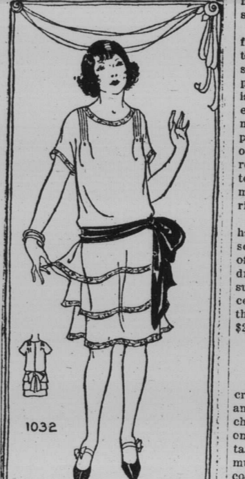
A Junior Party-frock

Each season the styles for children grow more fascinating. Designs and materials are chosen as thoughtfully as for grown-ups; and while the designs are more and more simple, they have gained in charm and individuality. Every little girl loves a party-frock, and No. 1032 of fine French voile, which comes in the most adorable colorings, and looks as light and filmy as chiffon, is sure to please her. The frock illustrated is a two-piece dress closing at the centre back with short kimono sleeves tucked and scampered on shoulders, and three slightly circular flounces. It may have square or bateau neck, and is trimmed with lace edging or insertion. The pattern is cut in sizes 8 to 14 years, the 12-year size requiring 3 1/2 yards of 36-inch material and 2 1/2 yards of 5-inch ribbon for sash. Pattern mailed to any address on receipt of 20c in silver, by the Wilcox Publishing Co., 73 West Adelaide St., Toronto. Order filled same day as received.