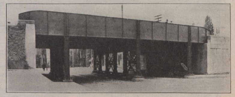
Fig. 2.-West Abutment Wall of Yonge Street Subway.