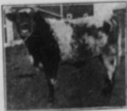
One of our Young Bulls.

The Home of one of Canada's Select Herds of High-class Short- horns