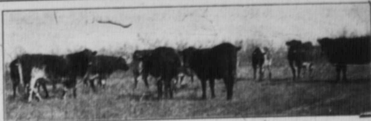
Some of my Shorthorn Females